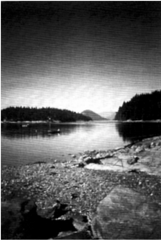
Coulter Bay on Cortes Island