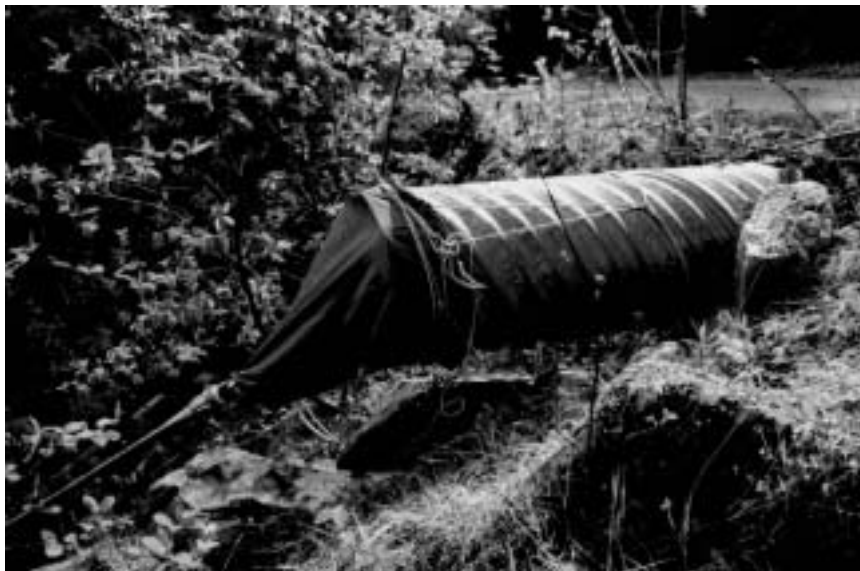
Will this replace your water system? Bourke residents' new intake.

The Bourke Creek Improvement District's water system, which supplies 34 homes at Nine Mile, had to be turned off after a landslide filled the creek above the water intake with debris. The landslide started at a switchback approximately eight kilometres up the Sitkum Creek Forest Service Road. Fifteen metres wide at the top, the slide ran about 600 metres to Bourke Creek and then another 200 to 300 metres down the creek channel.